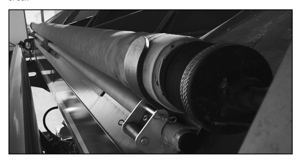
D. Z bracket and end caps located on front and rear of passenger side on top of box rail.

C. Tarp stops located on front, middle and rear of passenger side on diagonal portion of box